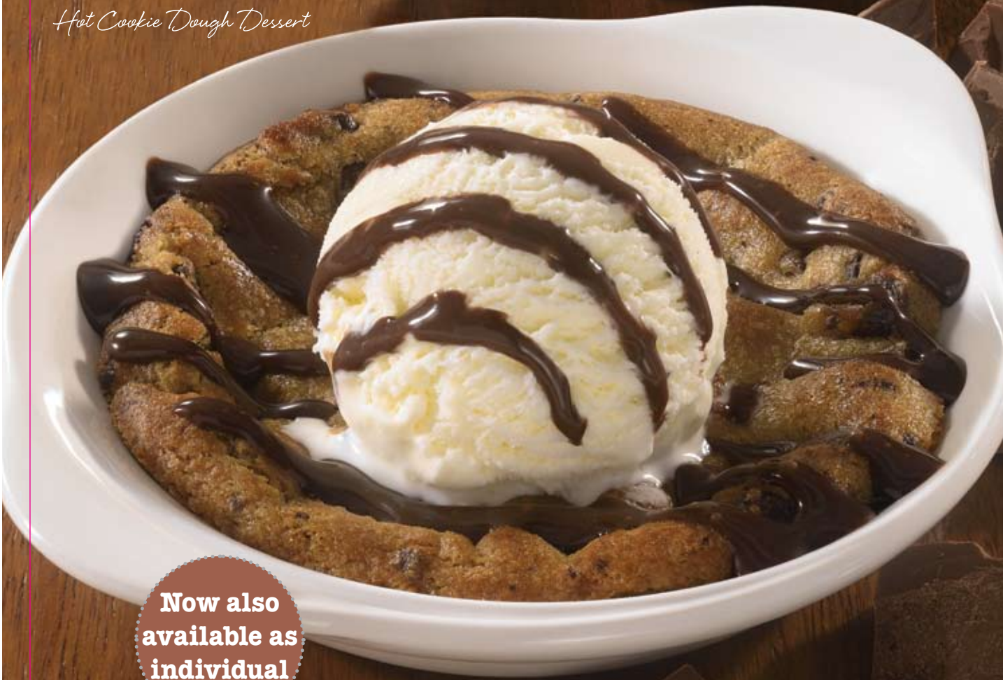
Hot Cookie Dough Dessert